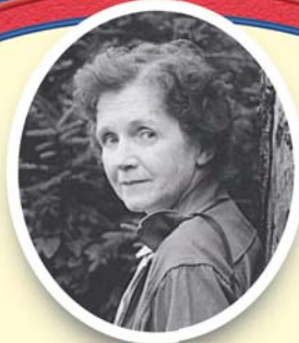
RACHEL CARSON 1907–1964

The marine biologist Rachel Carson was born far from the sea, in the small town of Springdale, Pennsylvania.