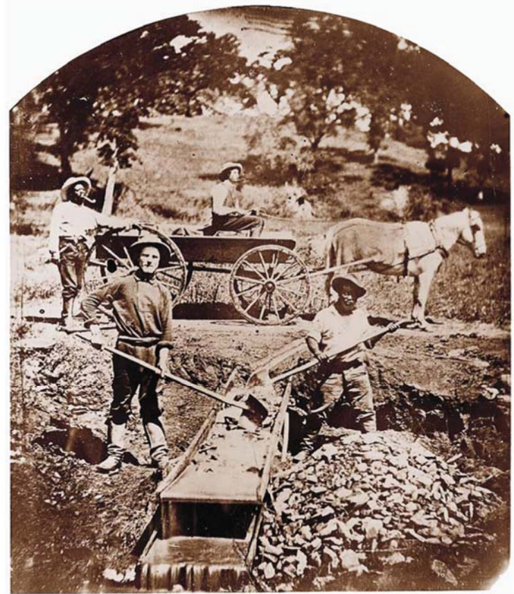
▲ Goldminers at Spanish Flat, California, 1852

When the news reached San Francisco, virtually the whole town hustled to the Sacramento Valley to pan for gold. On June 6, 1848, Monterey's mayor, Walter Colton, sent a scout to report on what was happening. The scout returned on June 14 with news of gold, and the mayor described the scene that followed as news traveled along the town's main street.