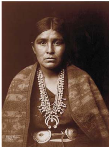
A Navajo man and woman in photographs taken by Edward S. Curtis.