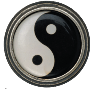
▲ Traditional yin-and-yang symbol

Other people turned to the ideas of ancient thinkers, such as the concept of yin and yang —two powers that together represented the natural rhythms of life. Yin represents all that is cold, dark, soft, and mysterious. Yang is the opposite—warm, bright, hard, and clear. The symbol of yin and yang is a circle divided into halves, as shown in the emblem to the upper right. The circle represents the harmony of yin and yang. Both forces represent the rhythm of the universe and complement each other. Both the I Ching and yin and yang helped Chinese people understand how they fit into the world.