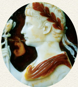
Augustus 63 B.C.—A.D. 14

Augustus was the most powerful ruler of the mightiest empire of the ancient world. Yet, amid the pomp of Rome, he lived a simple and frugal life. His home was modest by Roman standards. His favorite meal consisted of coarse bread, a few sardines, and a piece of cheese—the usual food of a common laborer.